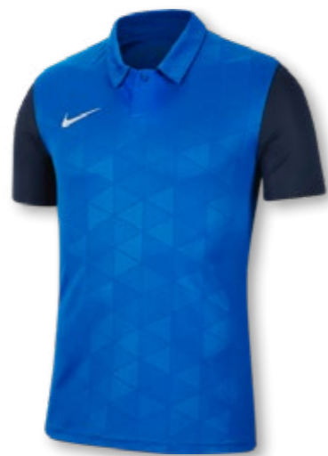
463 Royal Blue/Midnight Navy/White