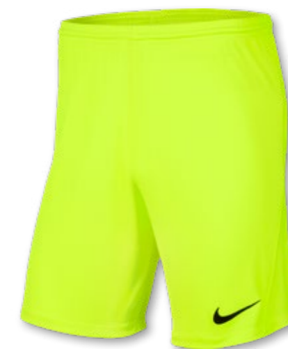
BV6855-702 Volt (Men's only)