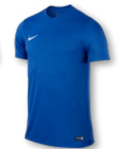
463 Royal Blue