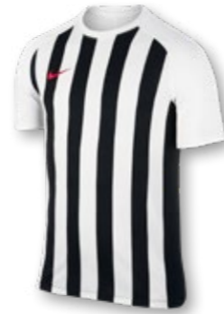
Black/University Gold Men's 832976 - 100 Youth's 832987 - 100