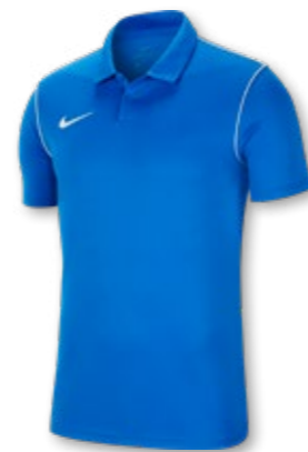
463 Royal Blue