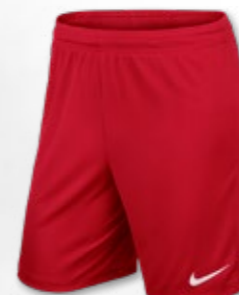
657 University Red