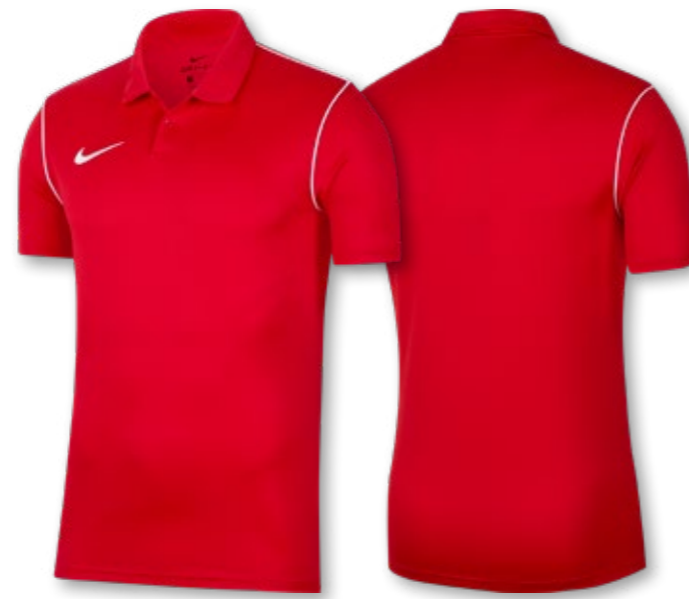
657 University Red