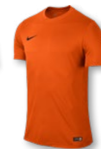
815 Safety Orange