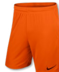
815 Safety Orange