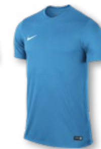
412 University Blue