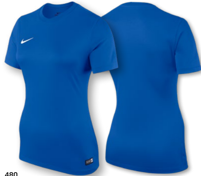
480 Royal Blue