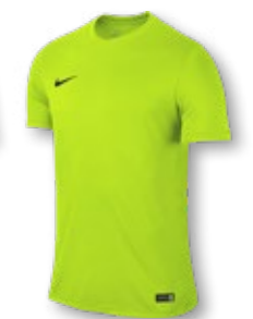
BV6708 - 702 Volt (Men's only)