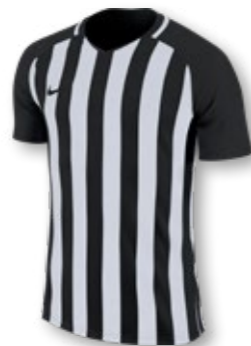
Black/White Men's 894081 - 010