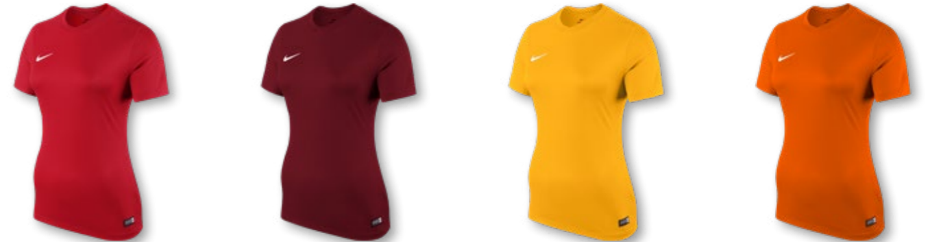
657 University Red