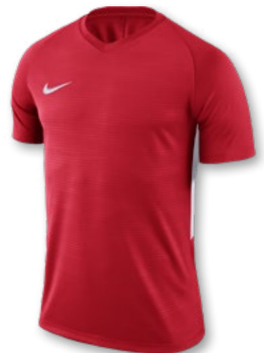
657 University Red