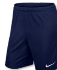
410 Midnight Navy