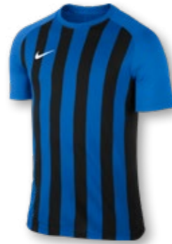
Royal Blue/Black Men's 832976 - 455 Youth's 832987 - 455