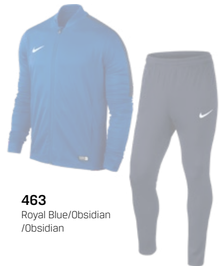
463 Royal Blue/Obsidian /Obsidian