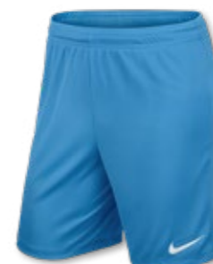
412 University Blue