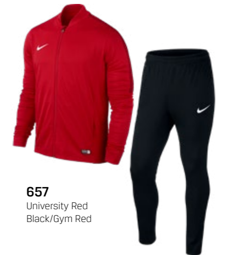
657 University Red Black/Gym Red