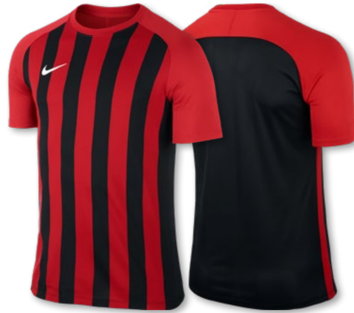
University Red/Black Men's 832976 - 657 Youth's 832987 - 657