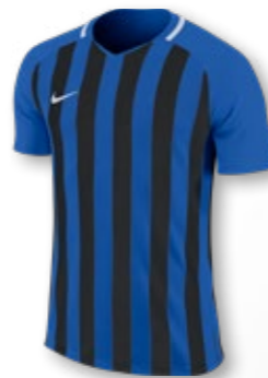
Royal Blue/Black Men's 894081 - 463