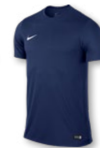
410 Midnight Navy