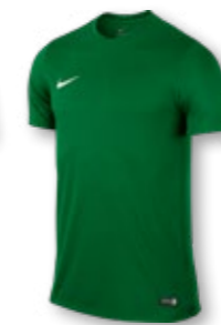
302 Pine Green