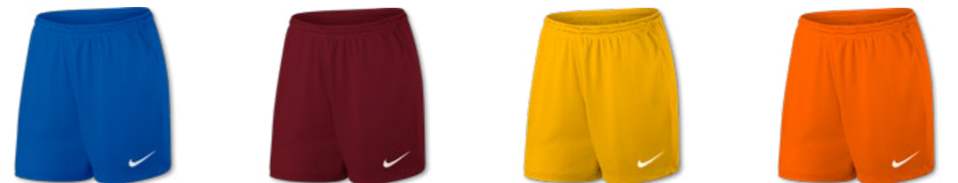
480 Royal Blue