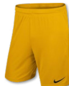
739 University Gold