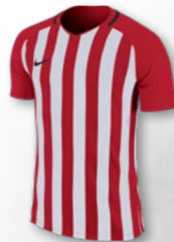
University Red/Black Men's 894081 - 658 Youth's 894102 - 658