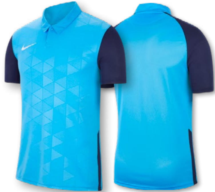
412 University Blue/Midnight Navy/White