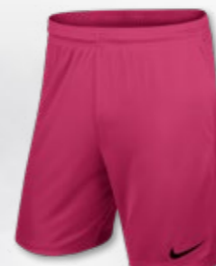
616 Vivid Pink