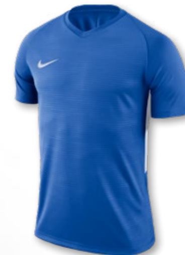
463 Royal Blue