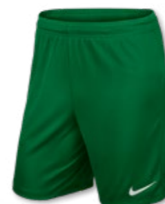
302 Pine Green