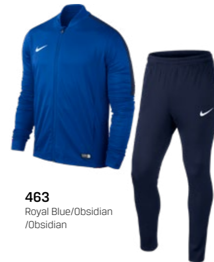
463 Royal Blue/Obsidian /Obsidian