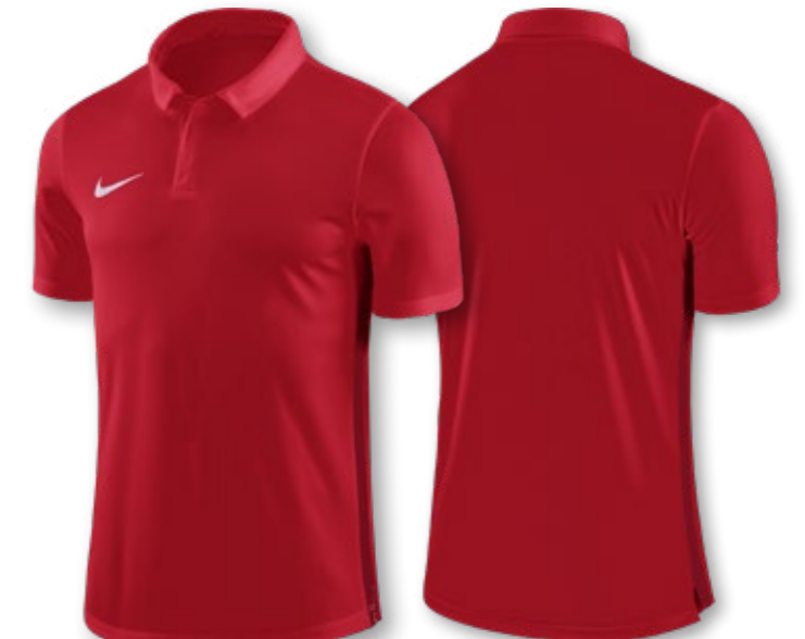
657 University Red/Gym Red