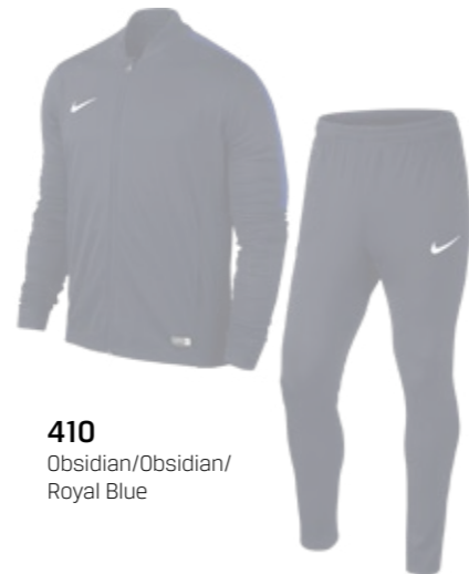
410 Obsidian/Obsidian/ Royal Blue