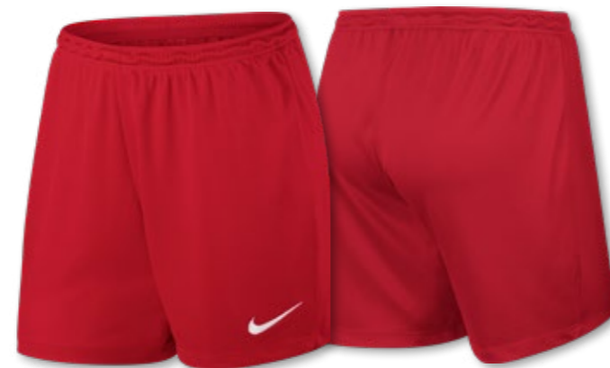
657 University Red