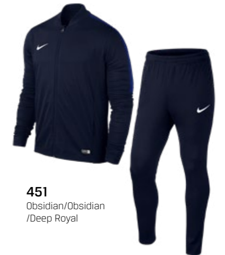
451 Obsidian/Obsidian /Deep Royal