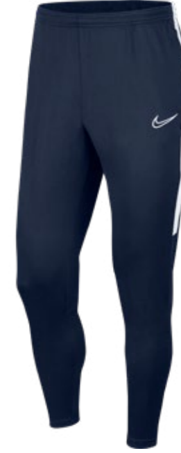
451 Obsidian (Men's only)