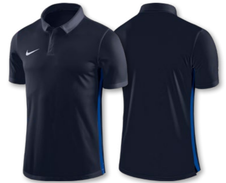
451 Obsidian/Royal Blue