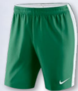
302 Pine Green/White