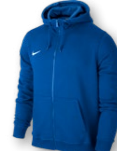
463 Royal Blue