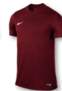
677 Team Red