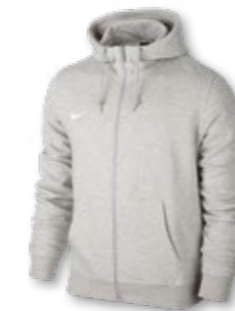
050 Grey Heather