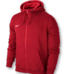
657 University Red