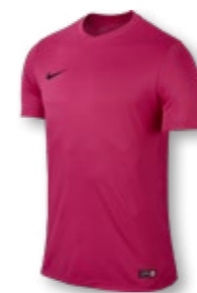
616 Vivid Pink