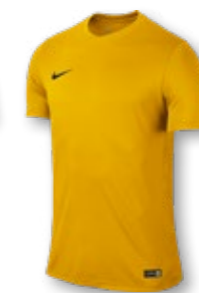
739 University Gold