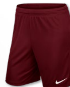
677 Team Red