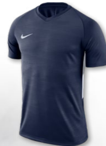
411 Midnight Navy