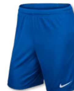
463 Royal Blue