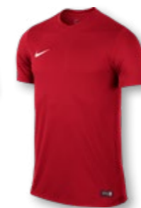
657 University Red