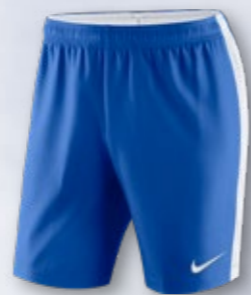
463 Royal Blue/White