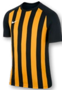
Black/University Gold Men's 832976 - 010 Youth's 832987 - 010